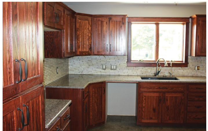
Custom built cabinets by Creative Wood Custom Cabinetry add a finishing touch to this magnificent kitchen.