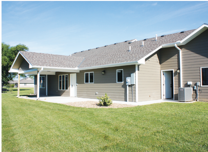
The backyard and patio provide ample space for entertaining.