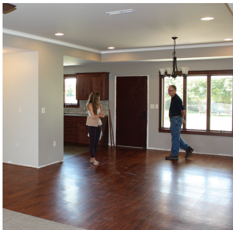
This open concept provides plenty of room for family meals and gatherings.