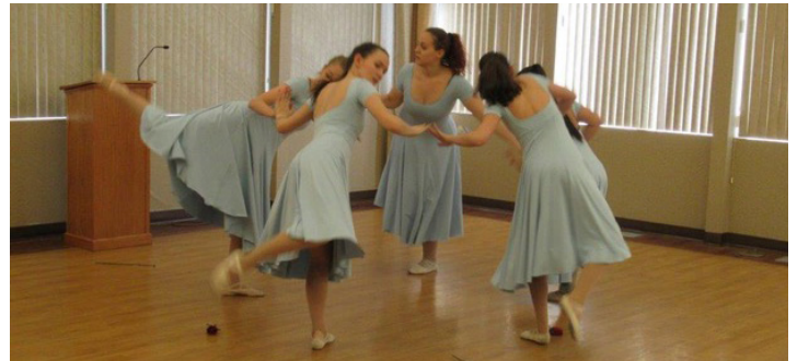
Dancers from the Bethel Academy of Performing Arts perform for residents during "Fine Arts Month."