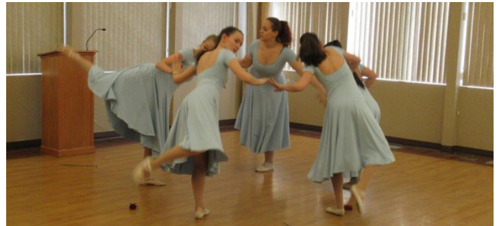
Dancers from the Bethel Academy of Performing Arts perform for residents during "Fine Arts Month."