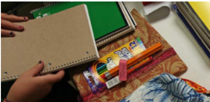
Packing MCC School kits

Our residents possess much wisdom and insight into the act of daily living and how to live a full life. Those who are service-minded have discovered that “one of the secrets of life is that all that is really worth