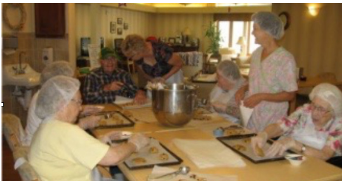
Residents bake cookies for local blood mobile, teachers, etc.

Visit the Bethesda website www.bethesdahome.org events tab for a full schedule of monthly events for the residents and/or follow us on Facebook to see pictures of recent activities. We welcome your comments. Here are a few shared by family members of individuals who lived and/or are living on the Bethesda campus: