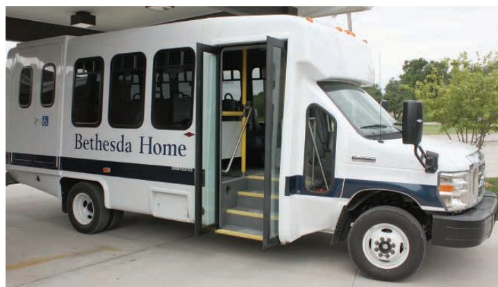
Bethesda’s new activity bus, funded by a Kansas Department of Transportation 5310 80/20 grant, has arrived and residents are excited about taking trips on it. The bus seats either 12 plus 2 wheel chair passengers, or 10 plus 3 wheel chair passengers. Residents will now be able to enjoy group activity trips such as shopping, sightseeing, etc.

To clarify our internal systems, there has been a change in definition between these two funds. Gifts designated to the Benevolent Care Fund go toward offsetting the Medicaid shortfall. (This will get changed on future response envelopes.) Until that change is made on the envelop, when the Resident Care Fund box is checked the gift will go toward the Medicaid shortfall unless noted otherwise. In the future, gifts to the Resident Care Fund go toward providing for incidental expenses of residents not covered by Medicaid.